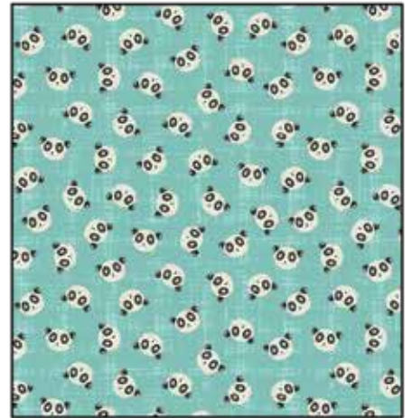
Panda Faces - Aqua 9481-16