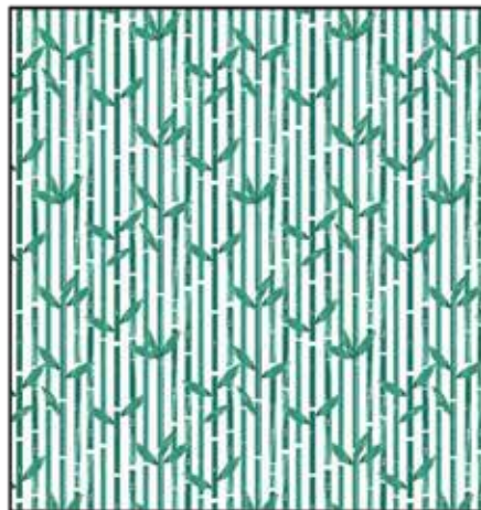
Bamboo - White 9483-01