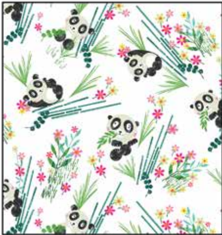
Pandas with Bamboo & Flowers - White 9479-01