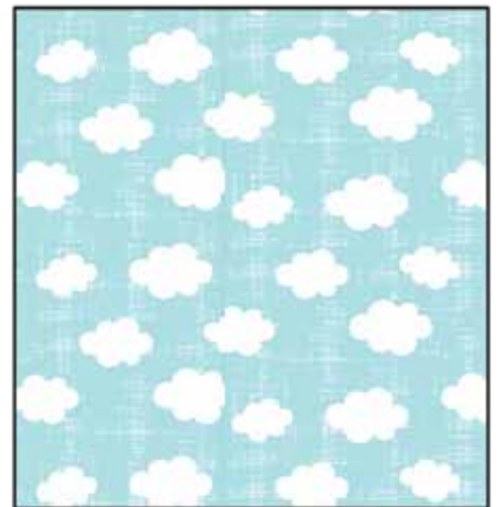
Sky - Lt. Blue 9484-11