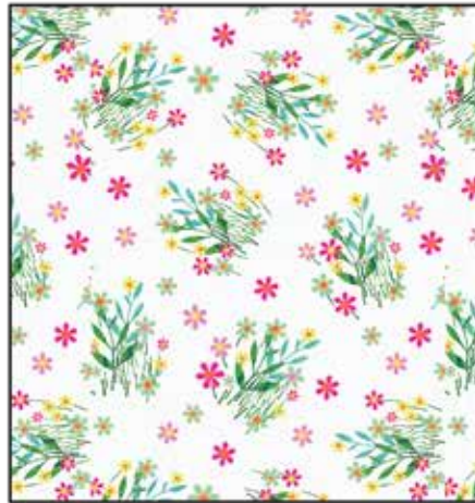
Stemmed Flowers - White 9480-01