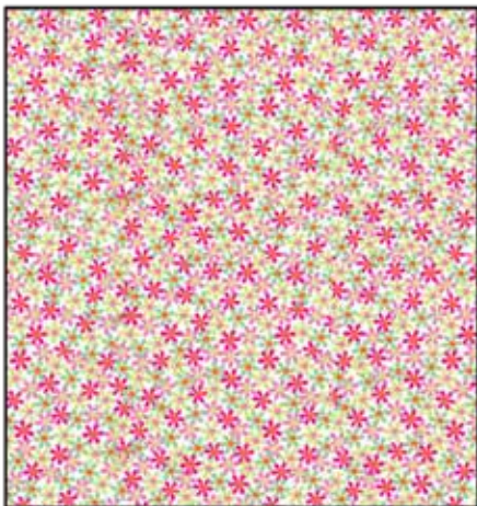
Allover Ditsy - Pink 9482-22