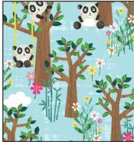
Panda in the Park - Lt. Blue 9477-11