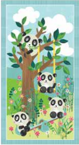
24" Panda Panel - Lt. Blue 9476P-11