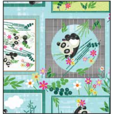
Panda Blocks - Lt. Blue 9478-11